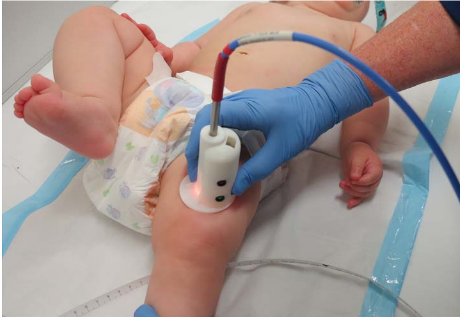
Figure 1. Measurement conducted on the anterior thigh using the Ocean Optics QEPro NIR device